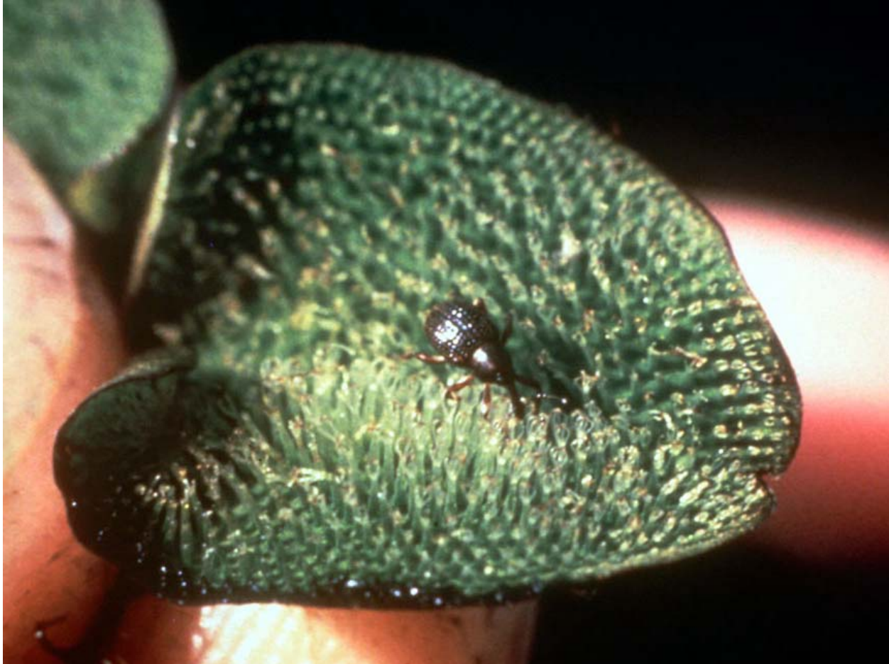
Figure 3. Photograph of Cyrtobagous salviniae on S. minima