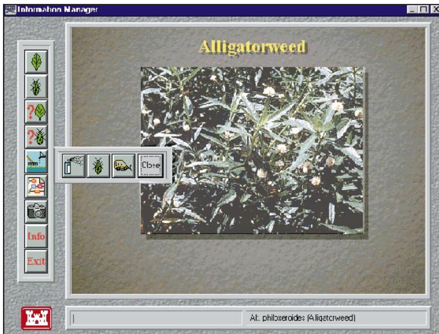
Figure 5. Information manager screen, showing how the user can access plant-specific management options. Selection of a specific management option is tied directly to the plant selected or identified. In this case, all three management areas are applicable since the three icons—representing chemical, biological, and mechanical control options—are displayed in full color (that is, illuminated)