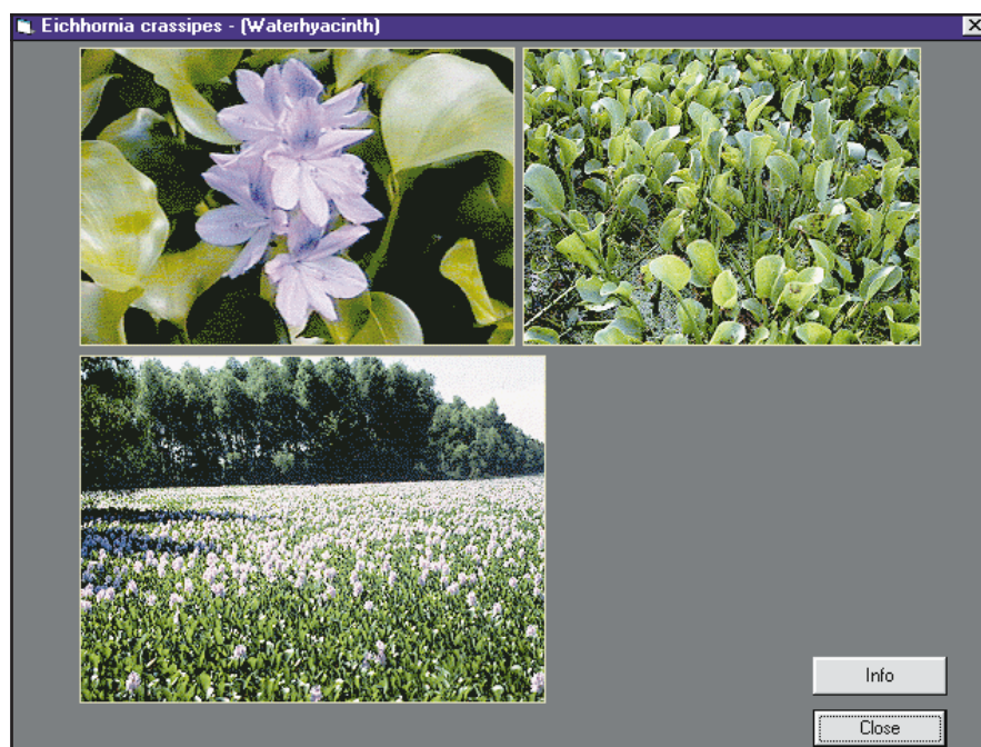
Figure 4. After selecting a plant from either the plant identification portion of APIS or from the plant list, full-color photographs can be displayed easily by selecting the camera icon or double-clicking on the plant picture located in the middle of the Information Manager. For most plant species, a series of photographs are used to illustrate all aspects of the plant, including close-ups of the flower, the plant, and population views. Access to plant-specific hyperlinked text files can be accessed by clicking on the "Info" button