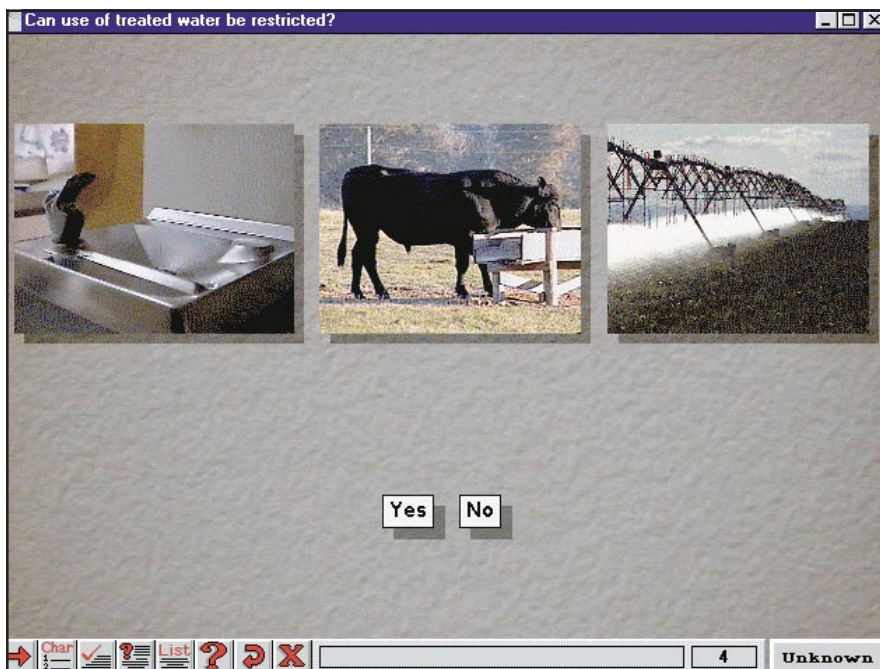
Figure 6. Users have the option of selecting the most appropriate herbicide by entering information on site characteristics. This information is entered by answering a series of questions concerning site location, water-use restrictions, flow rate, etc. This allows the user easy access to expert rules-of-thumb used in selecting the most appropriate herbicide for the target location