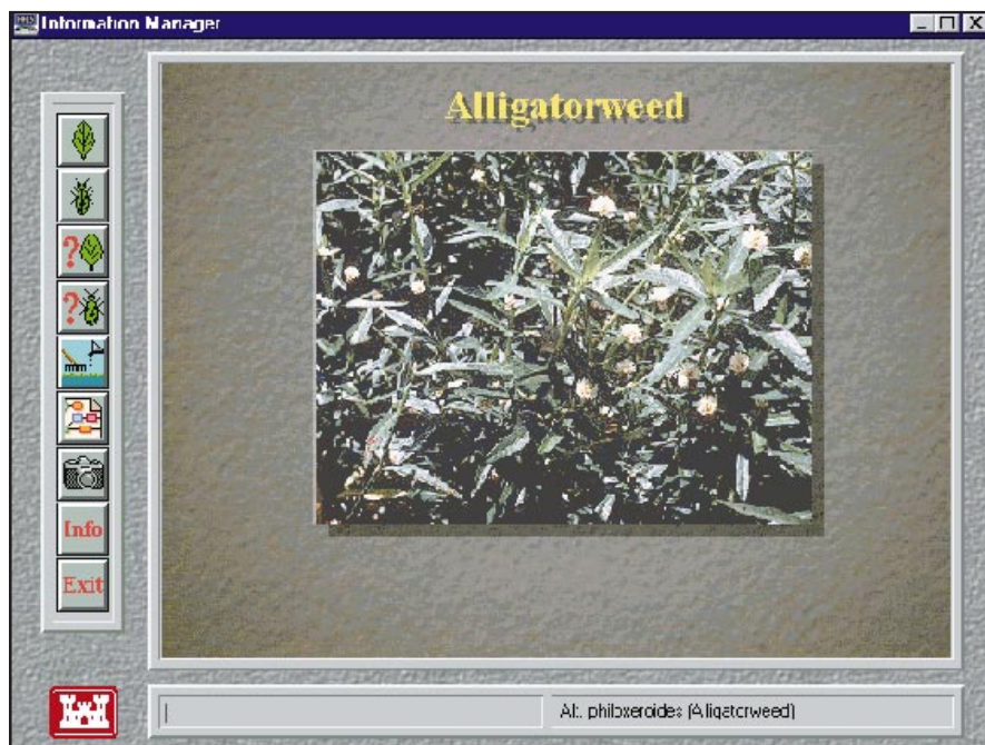
Figure 2. Information manager screen from the Aquatic Plant Information System. Access to information is accomplished by clicking on any one of the icons located on the left-hand side of the screen